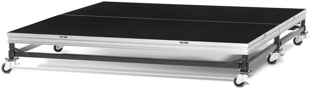
Rolling Drum Riser

Staging Concepts' Rolling Drum Riser complements your performance stage setup. Its understructure has dual locking casters to keep the riser in place during performances. When not in use, its understructure collapses for easy storage and transport. The Rolling Drum Riser is for use with SC90 Platforms.