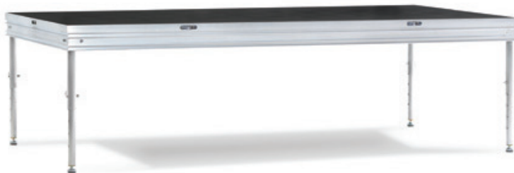
SC90 Platform with SC90 Adjustable Leg Supports