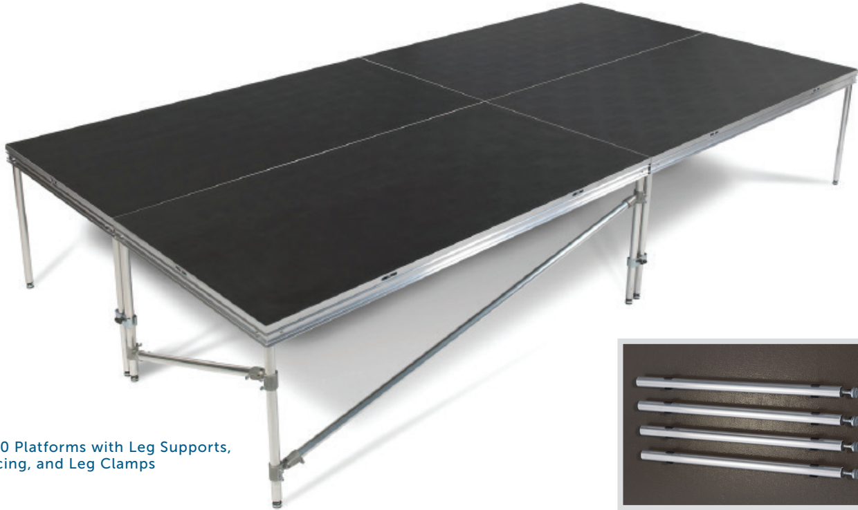
SC90 Platforms with Leg Supports, Bracing, and Leg Clamps

Our SC90 ® Leg Supports, used with the SC90 and SC97 Platforms, guarantee maximum durability and strength. The leg supports feature the same high quality aluminum that is used on our platforms. The leg supports are available in both fixed and adjustable heights, and have bracing and leg clamps available for extra stability and rigidity at higher elevations. In addition, our leg supports can be used with the most challenging custom applications on stages, seating, and choral riser systems.