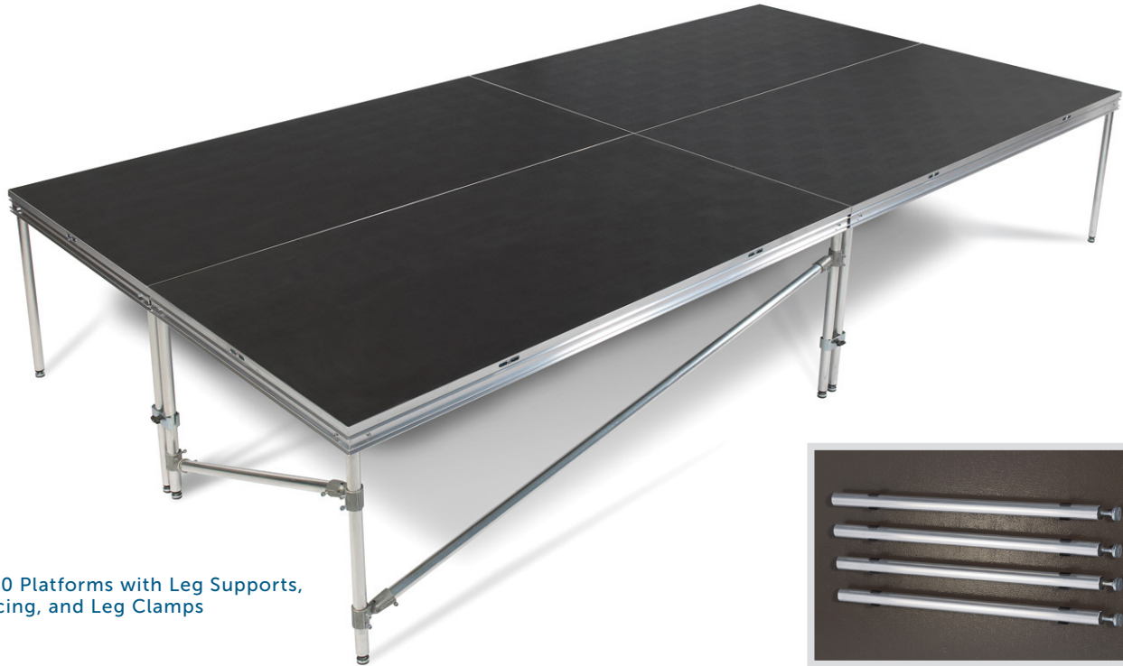
SC90 Platforms with Leg Supports, Bracing, and Leg Clamps

Our SC90® Leg Supports, used with the SC90, Truss, and SC97 Platforms, guarantee maximum durability and strength. The leg supports feature the same high quality aluminum that is used on our platforms. The leg supports are available in both fixed and adjustable heights, and have bracing and leg clamps available for extra stability and rigidity at higher elevations. In addition, our leg supports can be used with the most challenging custom applications on stages, seating, and choral riser systems.