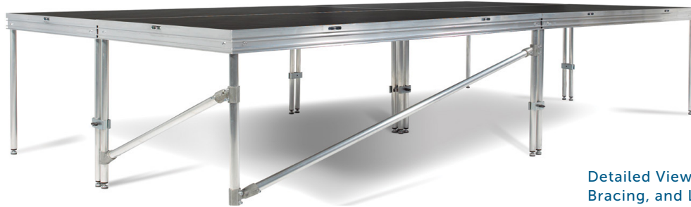
Detailed View of SC90 Leg Supports, Bracing, and Leg Clamps