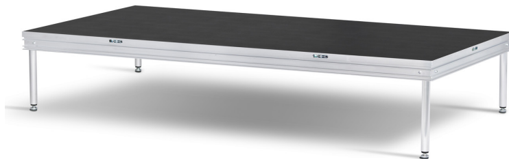
SC90 Platform with SC90 Adjustable Leg Supports