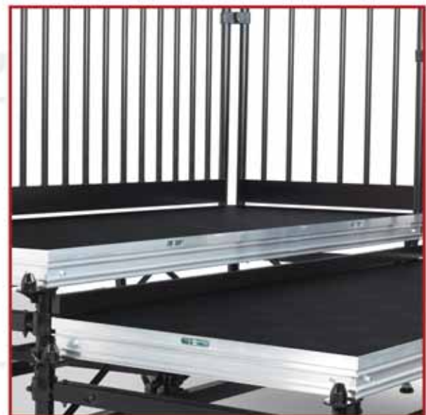
Detailed View of Chair Stop