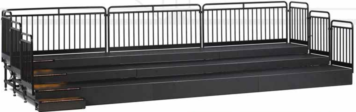
SC2000 Seating Riser with Aisle Lighting, Closure Panels, and IBC Guardrail

Aisle lighting is available to guide patrons to their seats and ensure safety during dimly lit performances. Closure panels and chair stops prevent chairs from slipping between levels and create a finished appearance. All accessories attach firmly to our platform extrusion with no loose parts.