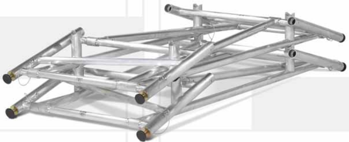
SC9600 Folding Bridge Support - Collapsed and Stacked