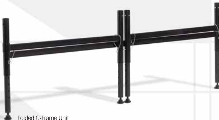
Folded C-Frame Unit