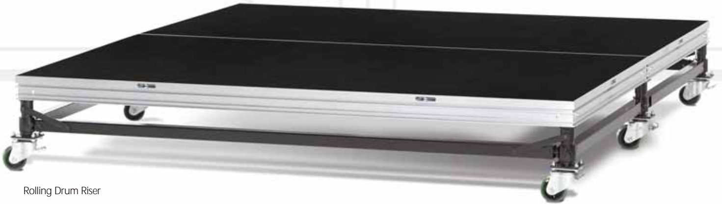
Rolling Drum Riser

Staging Concepts' Rolling Drum Riser complements your performance stage set-up. Its understructure has dual locking casters to keep the riser in place during performances. When not in use, its understructure collapses for easy storage and transport. The Rolling Drum Riser is for use with SC90 Platforms.