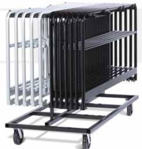
Guardrail Storage Cart