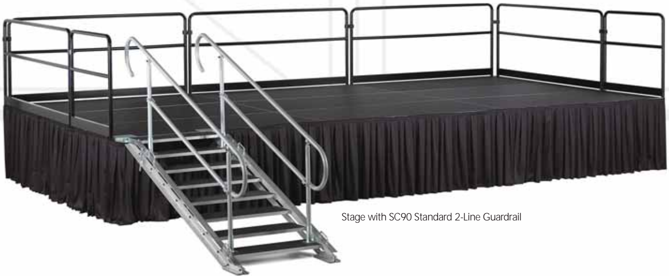
Stage with SC90 Standard 2-Line Guardrail

To ensure safety, Staging Concepts manufactures two styles of guardrail: standard 2-line and IBC (International Building Code) compliant guardrail. Both guardrails securely lock to the platforms. Customized styles are available upon request.