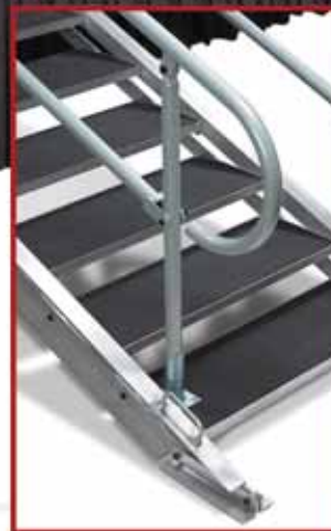
Adjustable Height Stair Unit – Side View