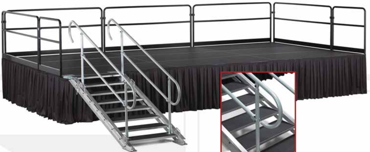
Stage with Adjustable Height Stair Unit

The Adjustable Height Stair Unit can be easily adjusted to fit stages that vary in height.