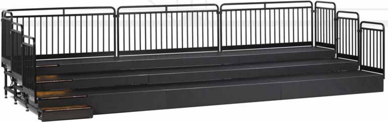
SC2000 Seating Riser with Aisle Lighting, Closure Panels, and IBC Guardrail

Aisle lighting is available to guide patrons to their seats and ensure safety during dimly lit performances. Closure panels and chair stops secure chairs from slipping between levels and create a finished appearance. All accessories attach firmly to our platform extrusion with no loose parts.