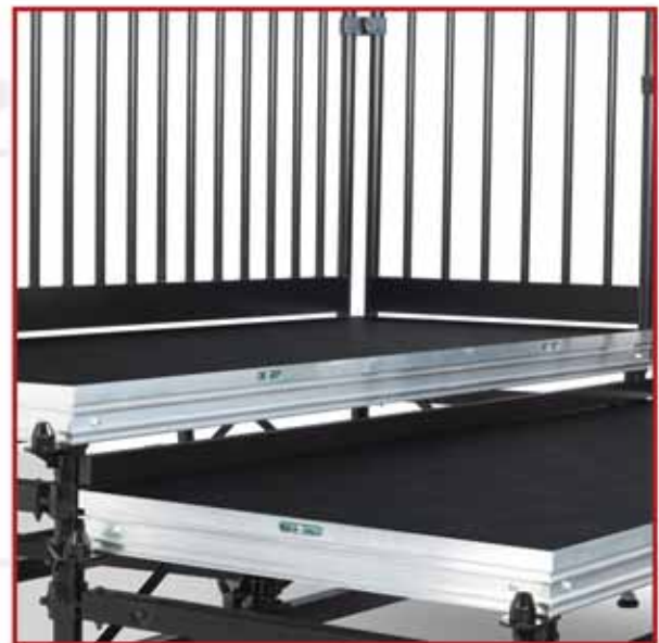
Detailed View of Chair Stop