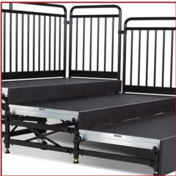
Detailed View of Closure Panels