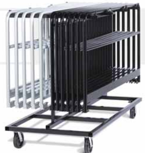
Guardrail Storage Cart