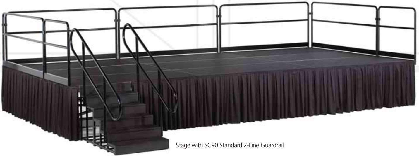
Stage with SC90 Standard 2-Line Guardrail

To ensure safety, Staging Concepts manufactures two styles of guardrail: standard 2-line and IBC (International Building Code) compliant guardrail. Both guardrails securely lock to the platforms. Customized styles are available upon request.