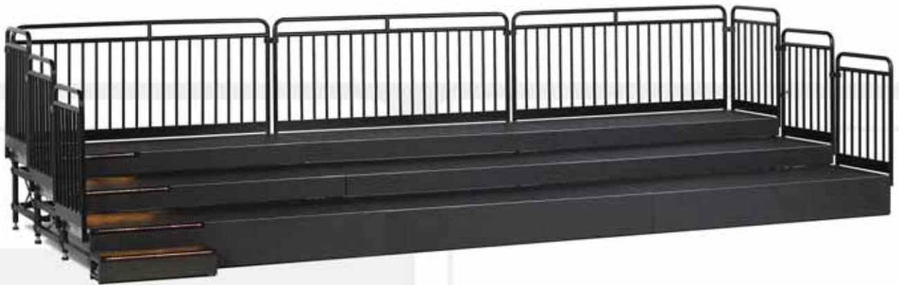
Riser System with SC90 IBC Compliant Guardrail