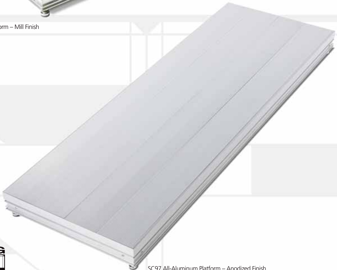
SC97 All-Aluminum Platform – Anodized Finish