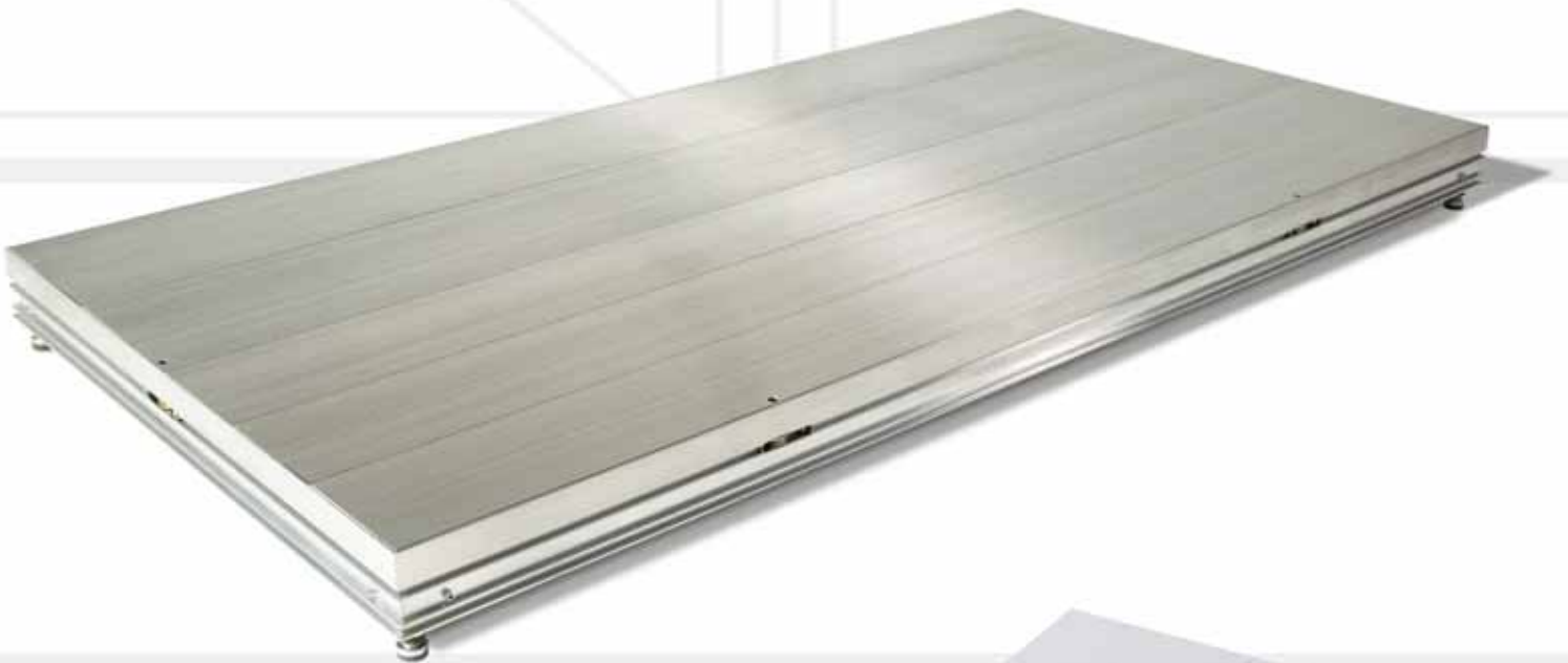
SC97 All-Aluminum Platform – Mill Finish

The SC97 Platform is an all-aluminum weatherproof deck used mainly in sports stadiums and arenas. It is engineered for strength and durability, and is lightweight. All decking and aisle steps are made of non-slip ribbed extruded aluminum. The SC97 is flexible and can be used with all Staging Concepts' supports.