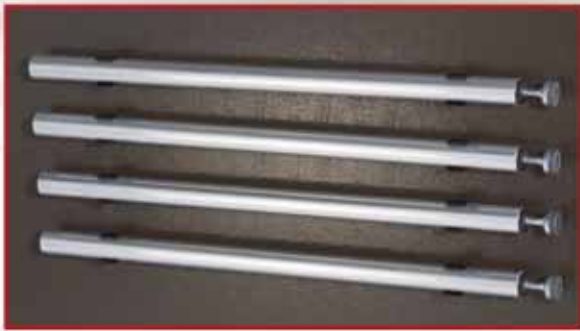
SC90 Underside's Built-in Leg Storage