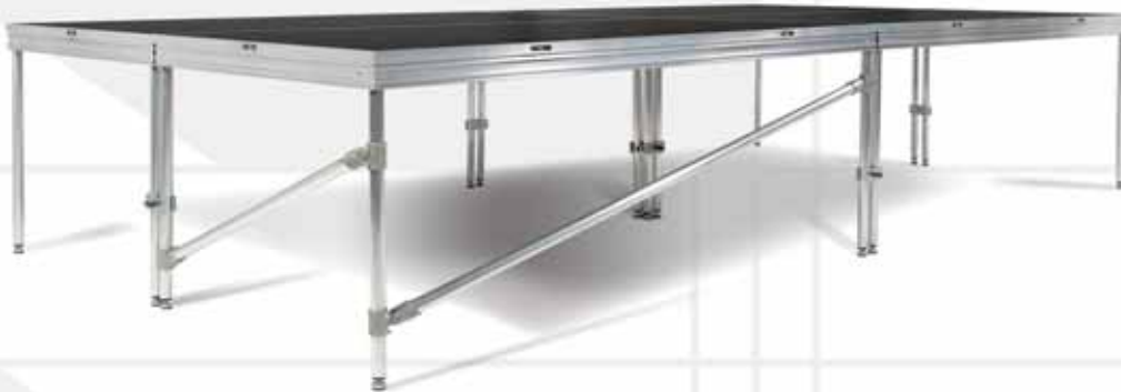
Detailed View of SC90 Leg Supports, Bracing, and Leg Clamps