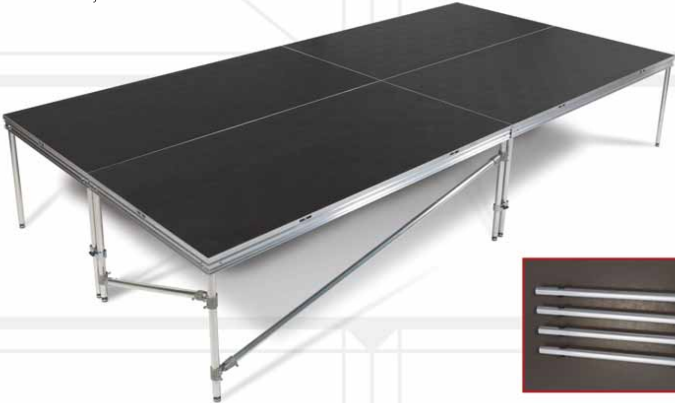
SC90 Platforms with Leg Supports, Bracing, and Leg Clamps

Our SC90 Leg Supports, used with the SC90 and SC97 Platforms, guarantee maximum durability and strength; the leg supports feature the same high quality aluminum that is used on our platforms. The leg supports are available in both fixed and adjustable heights, and have bracing and leg clamps available for extra stability and rigidity at higher elevations. In addition, our leg supports can be used with the most challenging custom applications on stages, seating, and choral riser systems.