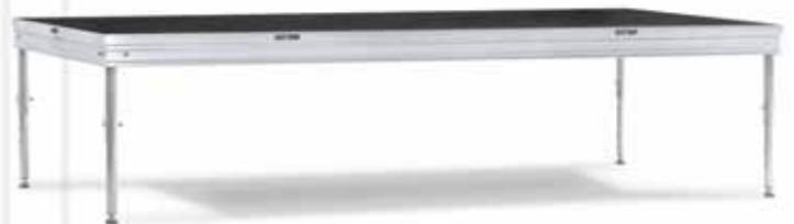
SC90 Platform with SC90 Adjustable Leg Supports