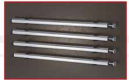
SC90 Underside's Built-in Leg Storage