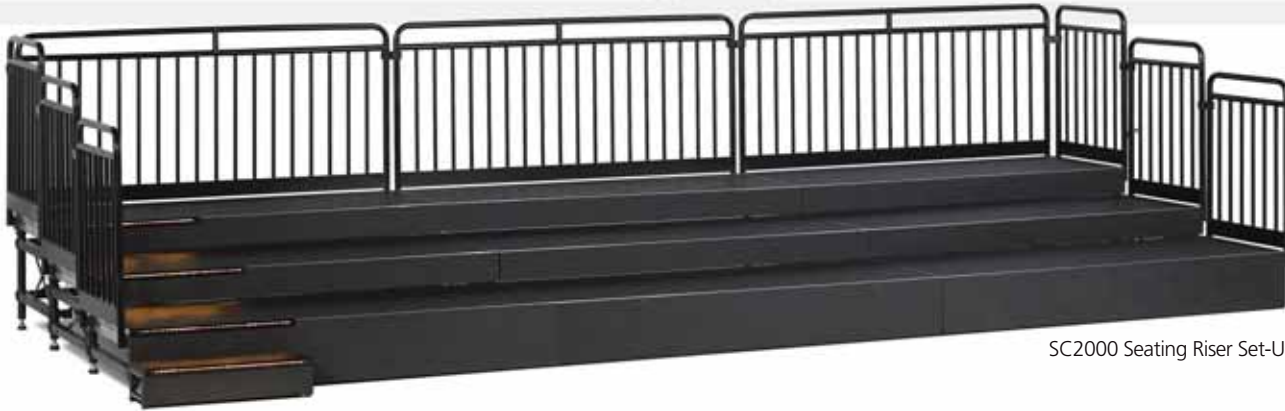
SC2000 Seating Riser Set-Up

The key features of the SC2000 are its quick setup, flexible configurations, and compact storage. The understructure unfolds like an accordion and expands to fill the designated space. Only two people are required for setup and custom sizes are available to fit into even the most unusual spaces. Should you need less or no seating at all, the SC2000 folds into 15% of its expanded size and easily rolls away on retractable casters for storage.