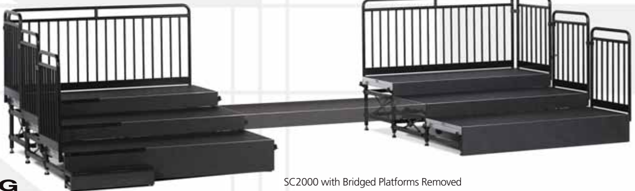
SC2000 with Bridged Platforms Removed