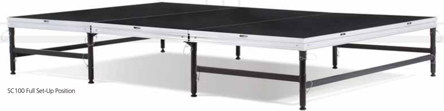
SC100 Full Set-Up Position

The SC100 Folding Bridge Frame, also referred to as a C-frame, is a functional frame that allows bridging between platforms, saving valuable setup time. The frame, which is available in fixed and adjustable heights, folds flat and is self-contained. Custom sizes are available and allow you to use the SC100 with the SC90 Single Side Platform or the SC97 All-Aluminum Platform.