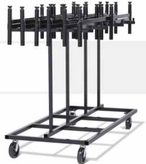
SC100 Storage Cart – Single Hanger