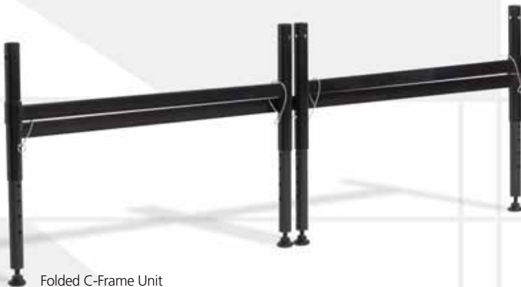
Folded C-Frame Unit